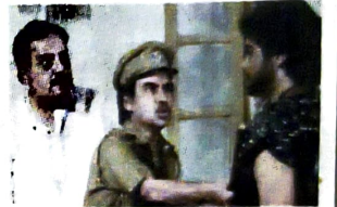
আশা ও ভালোবাসা রাত ১০.৩০ জি বাংলা সিনেমা

সন্ধ্যা ৬.২০ কিসমত কানেকশন, রাত ৯.০০ আটিকল ১৫, ১১.১৫ এনএইচ টেন অ্যান্ড পিকচার্স : দুপুর ২.৪৯ বাগি, বিকেল ৫.১৫ জিগর, রাত ৮.০০ ক্রান্তিবীর, ১০.৩৬ বিগ ধমাকা