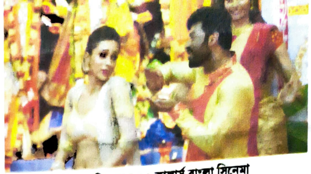
ডিলেন বিকেল ৪.০০ কার্লার্স বাংলা সিনেমা

Dakshin Dinajpur Zilla Parishad. Last Date of submission for NIT No. - DDP/N-30/2025-26 is 20/08/2025 at 13.00 Hours. Details of NIT can be seen in www.wbtenders.gov.in . Sd/- Additional Executive Officer Dakshin Dinajpur Zilla Parishad