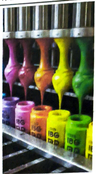
হাউ ইটস মেড দুপুর ২.১৫ ডিসকভারি

সিনেমা জলসা মুভিজ : সকাল ১০.৩০ খেলাঘর, দুপুর ১.৪৫ জঙ্গল এক শ্রেয়কথা, বিকেল ৪.০০ অন্ধবিচার, সন্ধ্যা ৭.১৫ দেবী, রাত ১০.৩০ হারজিৎ জি বাংলা সিনেমা : সকাল ৯.০০ মনে মনে, বেলা ১১.১০ লোফার, দুপুর ২.০০ মায়ের আশীর্বাদ, বিকেল ৪.৩৫ টক্কর, রাত ১০.৩০ আশা ও ভালোবাসা, ১.১০ সেভিং অ্যাকাউন্ট কার্লার্স বাংলা সিনেমা : সকাল ৮.০০ সংসার সংগ্রাম, দুপুর ১.০০ মহাশুরু, বিকেল ৪.০০ ডিলেন, সন্ধ্যা ৭.০০ এমএলএ ফটোকেষ্ট, রাত ১০.০০ চ্যালেঞ্জ ডিডি বাংলা : দুপুর ২.৩০ নতুন জীবন কার্লার্স বাংলা : দুপুর ২.০০ শিবাজি আকাশ আট : বিকেল ৩.০৫ প্রথম স্টার গোল্ড সিলেক্ট এইচডি : বেলা ১১.৪৫ হুম তুম শবানা, দুপুর ২.০০ ভবেশ যোশি সুপারহিরো, বিকেল ৪.৩০ সন্তা, সন্ধ্যা ৬.৩০ টশন, রাত ৯.০০ ফিলেমির, ১১.১৫ ট্রাফিক কার্লার্স সিনেপ্লেক্স : দুপুর ১২.০০ কটি, বিকেল ৩.০০ ডিভেগম, ৫.০০ বাগি-টু, রাত ১০.৩০ সপ্তগিরি এক্সপ্রেস অ্যান্ড এক্সপ্লোর এইচডি : দুপুর ১.৩০ দোনো, বিকেল ৪.০৭ মিসেস চ্যাটার্জি ভার্সেস নরওয়ে,