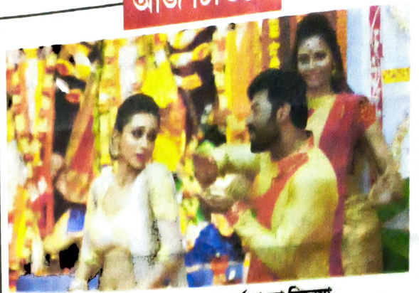
ভিলেন বিকেল ৪.০০ কালার্স বাংলা সিনেমা

der NIT and Corrigendum-I e Engineer, WBSRDA, e-NIT No-05/APD/ Details may be seen https://wbtenders.gov.in, notice board.