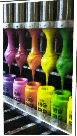
হাট্টেবাহী ট্রেনে মেড দুপুর ২.১৫ ডিসকভারি

জলসা মুভিজ : সকাল ১০.৩০ খেলাঘর, দুপুর ১.৪৫ জঙ্গল এক প্রেমকথা, বিকেল ৪.০০ অন্ধবিচার, সন্ধ্যা ৭.১৫ দেবী, রাত ১০.৩০ হারজিং জি বাংলা সিনেমা : সকাল ৯.০০ মনে মনে, বেলা ১১.১০ লোফার, দুপুর ২.০০ মায়ের আশীর্বাদ, বিকেল ৪.৩৫ টঙ্কর, রাত ১০.৩০ আশা ও ভালোবাসা, ১.১০ সেভিং অ্যাকাউন্ট কালার্স বাংলা সিনেমা : সকাল ৮.০০ সংসার সংগ্রাম, দুপুর ১.০০ মহাশুরু, বিকেল ৪.০০ ভিলেন, সন্ধ্যা ৭.০০ এমএলএ ফাটকেট, রাত ১০.০০ চ্যালেঞ্জ ডিডি বাংলা : দুপুর ২.৩০ নতুন জীবন কালার্স বাংলা : দুপুর ২.০০ শিবাজি আকাশ আট : বিকেল ৩.০৫ প্রণ স্টার গোল্ড সিলেক্ট এইচডি : বেলা ১১.৪৫ হুম তুম শবানা, দুপুর ২.০০ ভবেশ যোশি সুপারহিরো, বিকেল ৪.৩০ সন্তা, সন্ধ্যা ৬.৩০ টশন, রাত ৯.০০ ফিল্টারি, ১১.১৫ ট্রাফিক কালার্স সিনেপ্লেক্স : দুপুর ১২.০০ কাট, বিকেল ৩.০৫ ভিভেগম, ৫.০০ বাগি-টু, রাত ১০.৩০ সপ্তগিরি এক্সপ্রেস অ্যান্ড এক্সপ্লোর এইচডি : দুপুর ১.৩০ দোনো, বিকেল ৪.০৫ মিসেস চ্যাটার্জি ভার্সেস নরওয়ে,