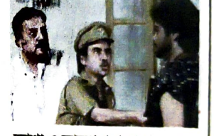
আশা ও ভালোবাসা রাত ১০.৩০ জি বাংলা সিনেমা

সন্ধ্যা ৬.২০ কিসমত কানেকশন, রাত ৯.০০ আটিকল ১৫, ১১.১৫ এনএইচ টেন অ্যান্ড পিকচার্স : দুপুর ২.৪৯ বাগি, বিকেল ৫.১৫ জিগর, রাত ৮.০০ ক্রান্তিবীর, ১০.৩৬ বিগ ধমাকা