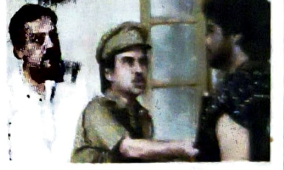
আশা ও ভালোবাসা রাত ১০.৩০ জি বাংলা সিনেমা

সন্ধ্যা ৬.২০ কিসমত কানেকশন, রাত ৯.০০ আর্টিকল ১৫, ১১.১৫ এনএইচ টেন অ্যান্ড পিকচার্স : দুপুর ২.৪৯ বাগি, বিকেল ৫.১৫ জিগার, রাত ৮.০০ ক্রান্তিবীর, ১০.৩৬ বিগ ধমাকা