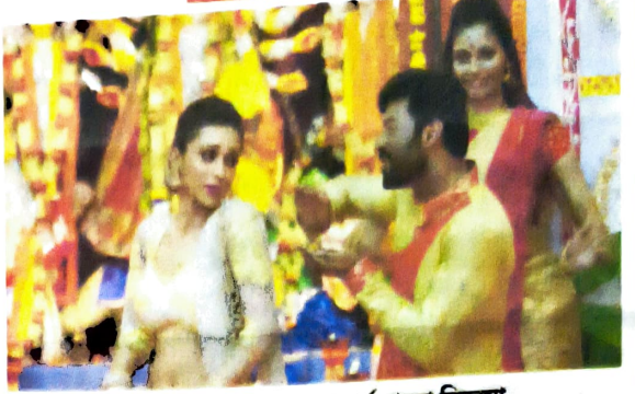
ডিলেন বিকেল ৪.০০ কার্লস বাংলা সিনেমা