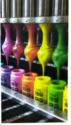
হাট ইন্স মেড দুপুর ২.১৫ ডিসকভারি

জলসা মুভিজ : সকাল ১০.৩০ খেলাঘর, দুপুর ১.৪৫ জঙ্গল এক প্রেমকথা, বিকেল ৪.০০ অন্ধবিচার, সন্ধ্যা ৭.১৫ দেবী, রাত ১০.৩০ হারজিং জি বাংলা সিনেমা : সকাল ৯.০০ মনে মনে, বেলা ১১.১০ সোফার, দুপুর ২.০০ মায়ের আশীর্বাদ, বিকেল ৪.৩৫ টকর, রাত ১০.৩০ আশা ও ভালোবাসা, ১.১০ সেভিং অ্যাকাউন্ট কার্লস বাংলা সিনেমা : সকাল ৮.০০ সংসার সংগ্রাম, দুপুর ১.০০ মহাশুরু, বিকেল ৪.০০ ডিলেন, সন্ধ্যা ৭.০০ এমএলএ ফাটকেট, রাত ১০.০০ চ্যালেঞ্জ ডিডি বাংলা : দুপুর ২.৩০ নতুন জীবন কার্লস বাংলা : দুপুর ২.০০ শিবাজি আকাশ আট : বিকেল ৩.০৫ প্রথম স্টার গোল্ড সিলেট এইচডি : বেলা ১১.৪৫ হুম তুম শবানা, দুপুর ২.০০ ভবেশ যোগি সুপারহিরো, বিকেল ৪.৩০ সভা, সন্ধ্যা ৬.৩০ টশন, রাত ৯.০০ ফিলোফি, ১১.১৫ ট্রাফিক কার্লস সিনেপ্লেক্স : দুপুর ১২.০০ কটি, বিকেল ৩.০০ ডিভেগম, ৫.০০ বাগিচা, রাত ১০.৩০ সপ্তগিরি এক্সপ্রেস অ্যান্ড এক্সপ্লোর এইচডি : দুপুর ১.৩০ দোনো, বিকেল ৪.০৭ মিসেস চ্যাটার্জি জার্সেস নরওয়ে,