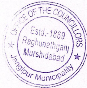
Executive Officer Jangipur Municipality

This letter should be treated as formal work order.