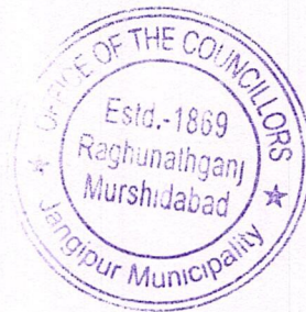
Executive Officer Jangipur Municipality

This letter should be treated as formal work order.