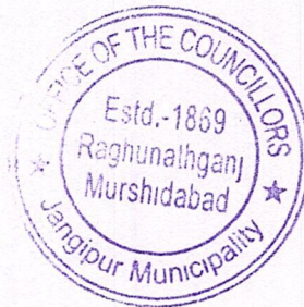
Executive Officer Jangipur Municipality

This letter should be treated as formal work order.