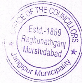
Executive Officer Jangipur Municipality

This letter should be treated as formal work order.