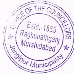
Executive Officer Jangipur Municipality

This letter should be treated as formal work order.