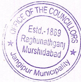
Executive Officer Jangipur Municipality

This letter should be treated as formal work order.