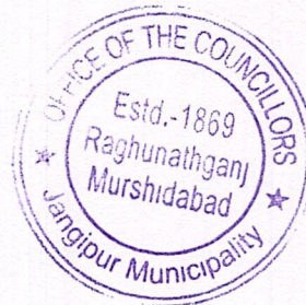
Executive Officer Jangipur Municipality

This letter should be treated as formal work order.