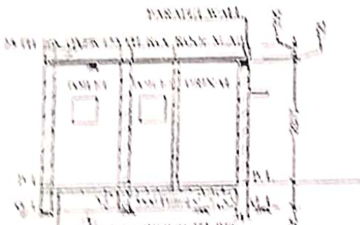
SECTION - 'A - A'