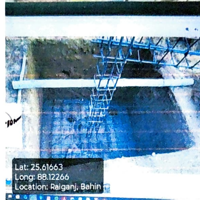
Earth Cutting Image