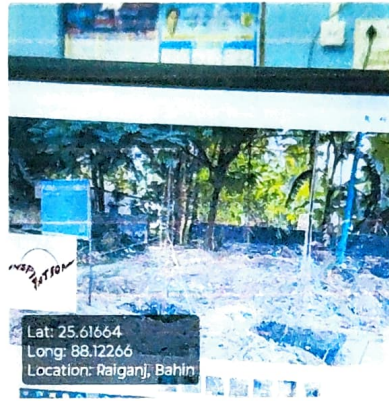
QR Code Board Image