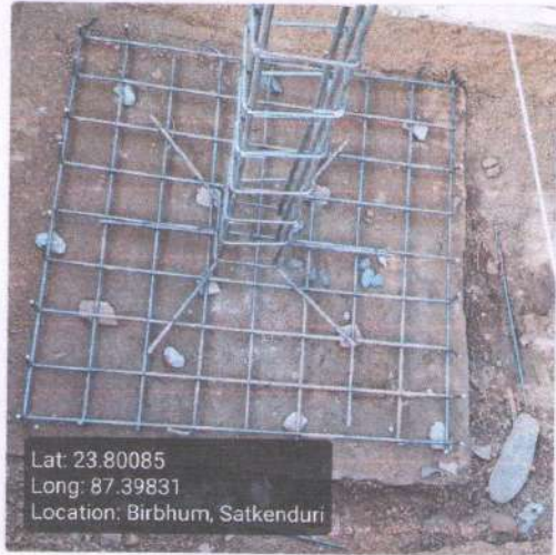
Column (12 mm dia 6 nos)