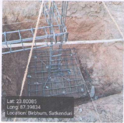
Earth Cutting Image