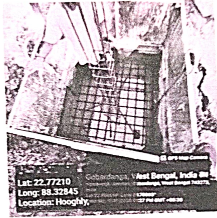
Earth Cutting Image