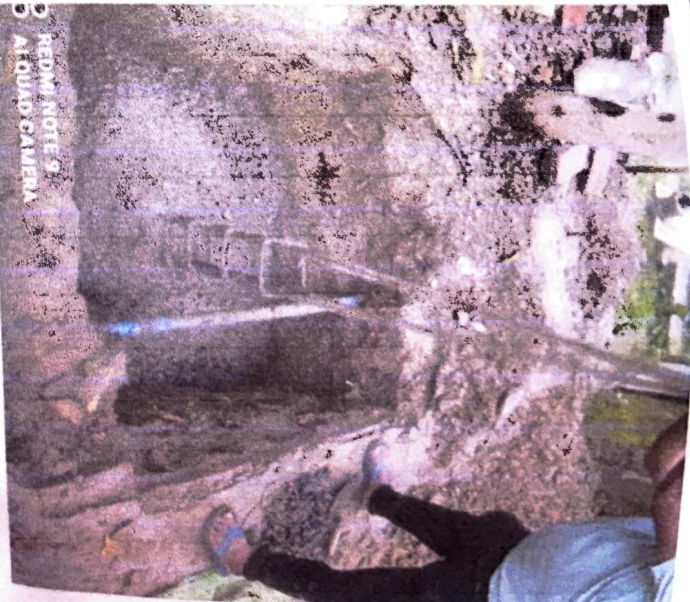
AROMI NOTE 9 O MUQD CAUREVA