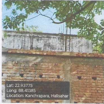
QR Code Board Image