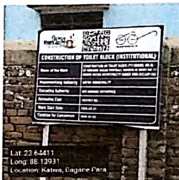
QR Code Board Image

Lat: 23.64411 Long: 88.13931 Location: Katwa, Bagare Para