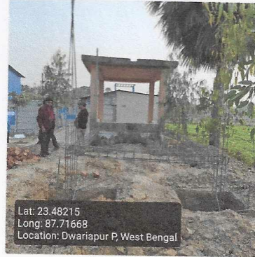
QR Code Board Image