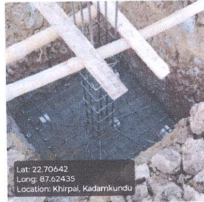
Earth Cutting Image