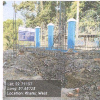
QR Code Board image