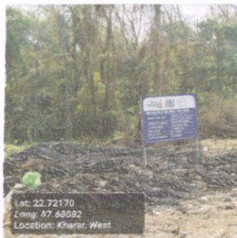
QR Code Board Image