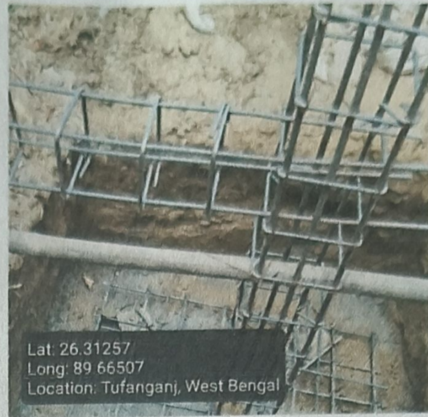
Tie beam Image