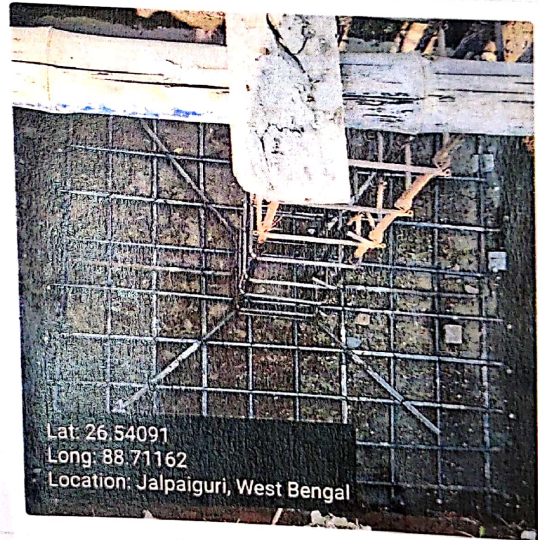
Column (12 mm dia 6 nos)