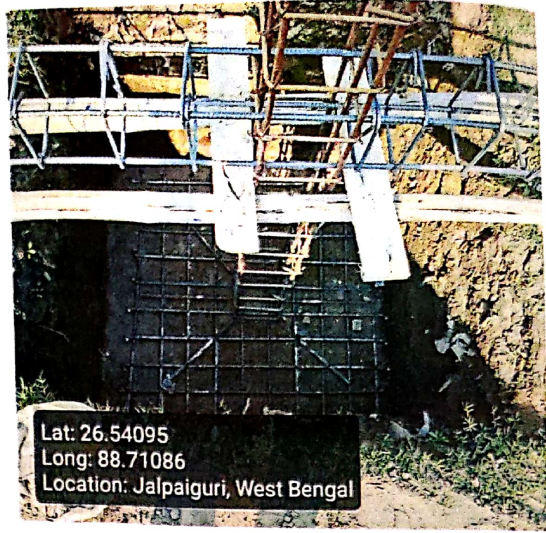
Earth Cutting Image