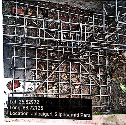
Column (12 mm dia 6 nos)