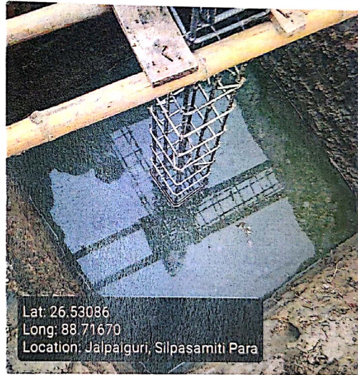
Column (12 mm dia 6 nos)