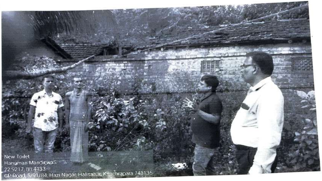
New Toilet Hanuman Mandir, waS 22.9217, 88.4133 GP Road, S/91/84, Hazi Nagar, Halisahar, Kanchrapara 743136