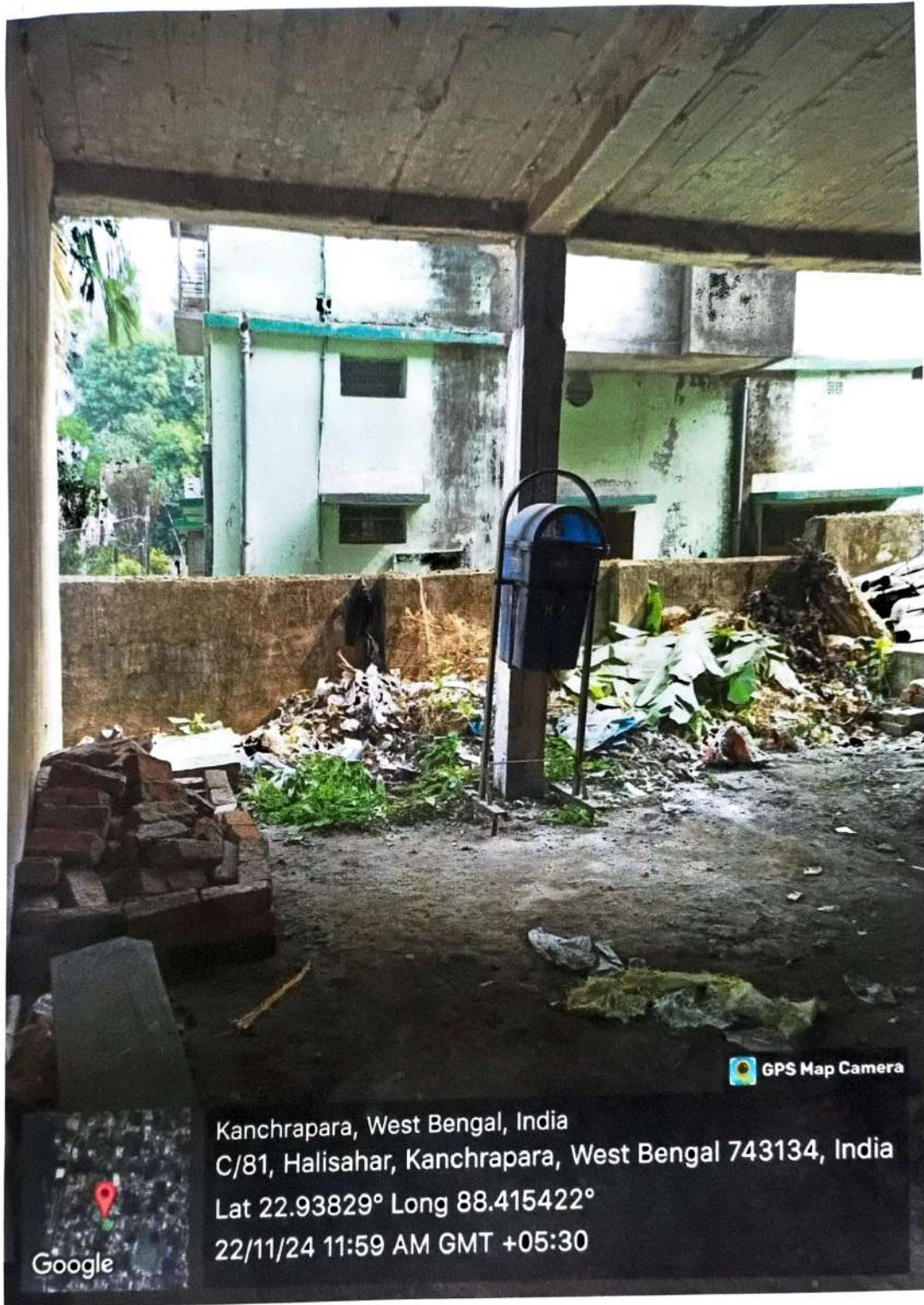
Annapurna Balika Vidyalay Unit-I & II