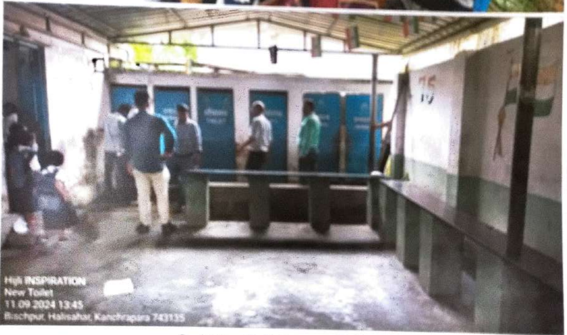
Bal Hindi Primary School