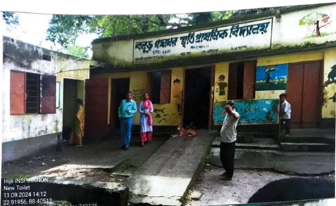
Hijli INSPIRATION New Toilet 11.09.2024 14:12 22.91956, 88.40512 Hazi Nagar, Halisahar, Kolkata 743135