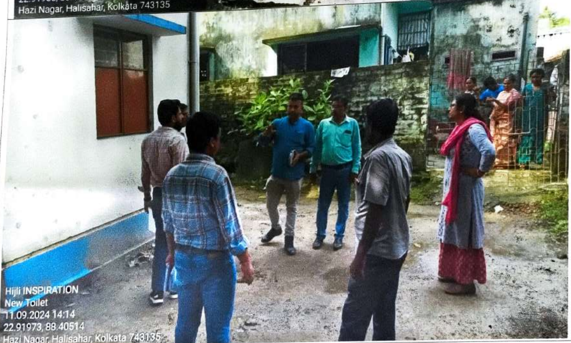
Hijli INSPIRATION New Toilet 11.09.2024 14:14 22.91973, 88.40514 Hazi Nagar, Halisahar, Kolkata 743135