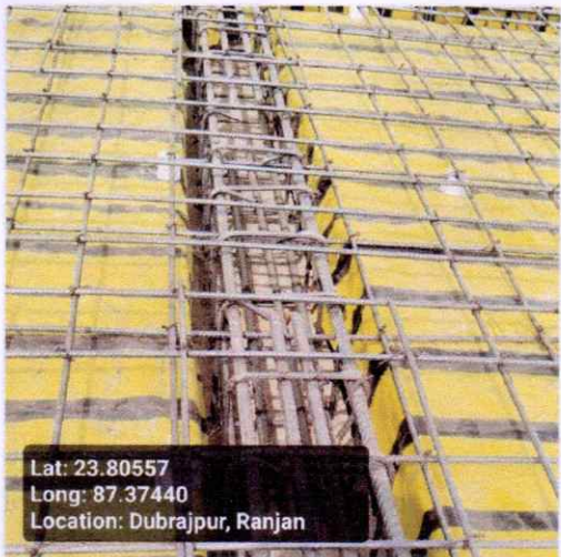
Roof Beam Mid Span Bottom Support (16 mm dia 4 nos)