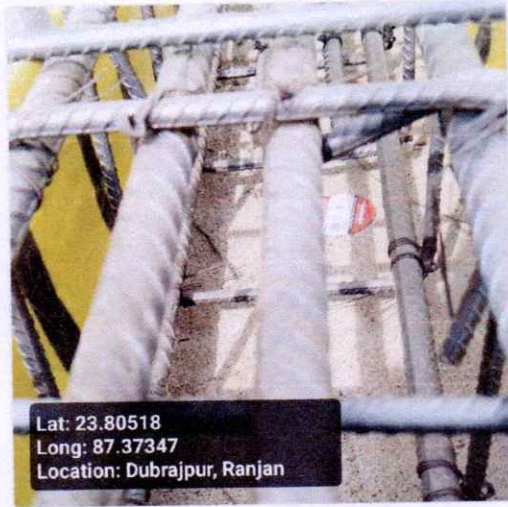
m Mid Span Bottom Support Image

Roof Details Parameters (8 mm dia 125 nos)