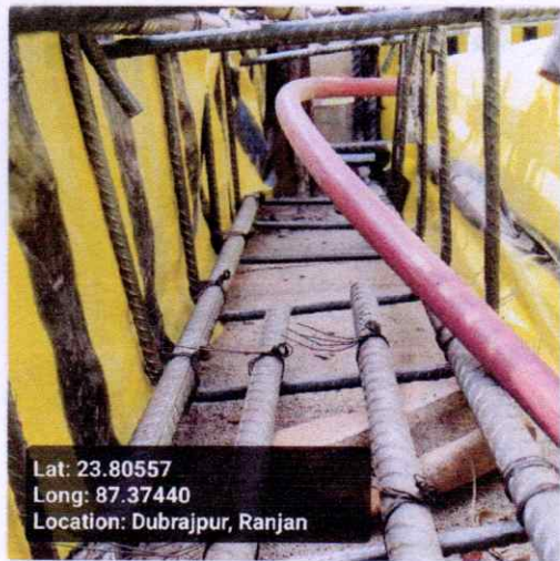
Roof Beam Mid Span Top Support (16 mm dia 2 nos)