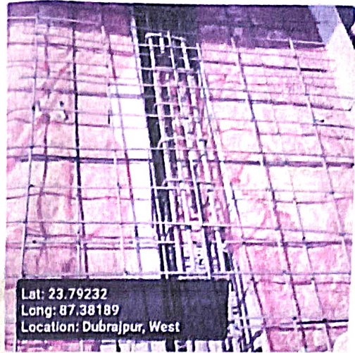
Roof Beam Bottom Support (16 mm dia, 2 nos.)