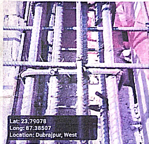
Roof Beam Mid Span Top Support (16 mm dia 2 nos)