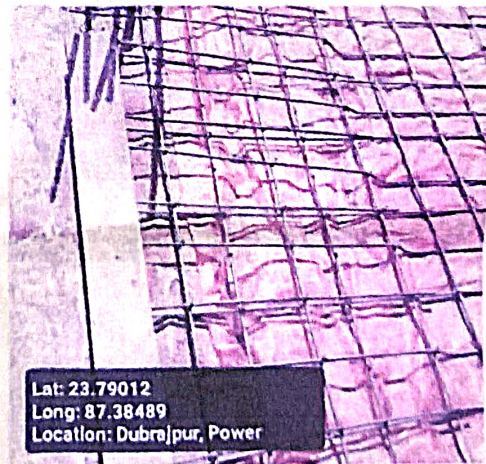
Roof Beam Mid Span Bottom Support (16 mm dia 4 nos)