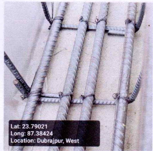
Roof Beam Mid Span Top Support (16 mm dia 2 nos)