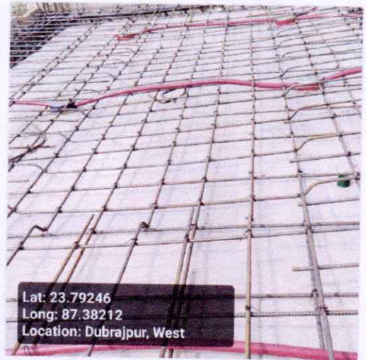
Binder for Roof Beam Support (250mm X 250mm)