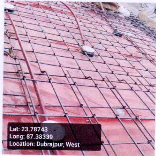
Binder for Roof Beam Support (250mm X 250mm)