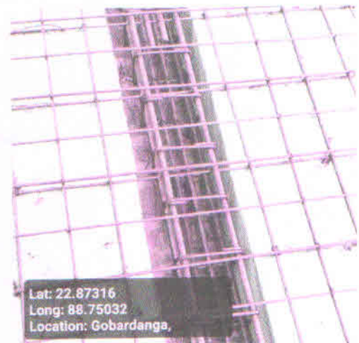
Roof Beam Mid Span Bottom Support (16 mm dia 4 nos)