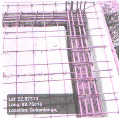
Roof Beam Bottom Support (16 mm dia, 2 nos.)