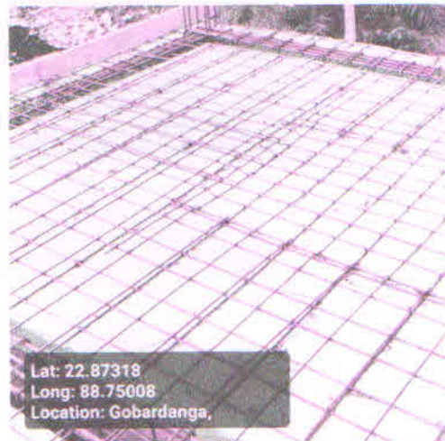
Binder for Roof Beam Support (250mm X 250mm)