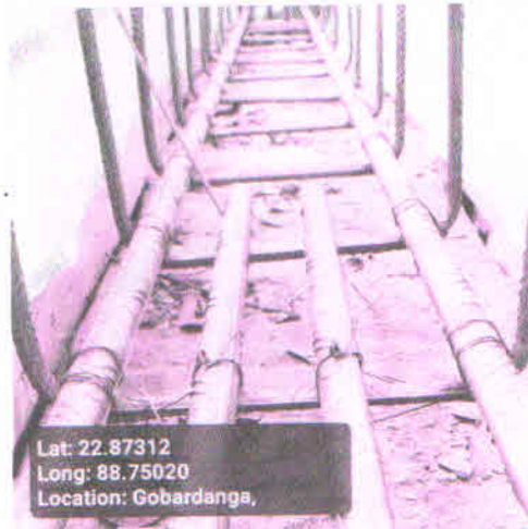
Roof Beam Mid Span Top Support (16 mm dia 2 nos)