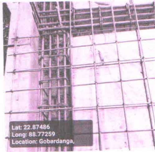
Roof Beam Bottom Support (16 mm dia, 2 nos.)