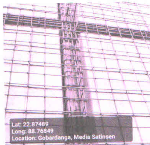
Roof Beam Mid Span Bottom Support (16 mm dia 4 nos)