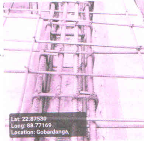
Roof Beam Mid Span Top Support (16 mm dia 2 nos)