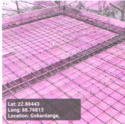
Binder for Roof Beam Support (250mm X 250mm)