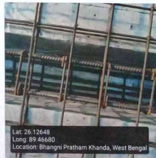
Roof Beam Mid Span Bottom Support (16 mm dia 4 nos)