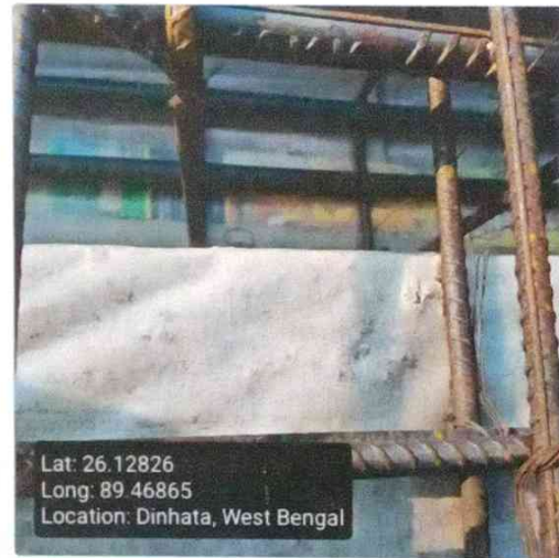
Roof Beam Mid Span Top Support (16 mm dia 2 nos)