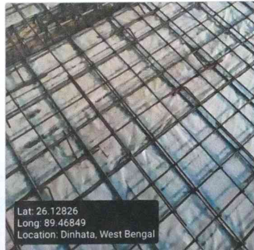
Binder for Roof Beam Support (250mm X 250mm)