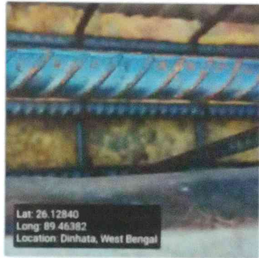
Roof Beam Mid Span Top Support (16 mm dia 2 nos)