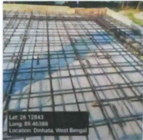
Binder for Roof Beam Support (250mm X 250mm)