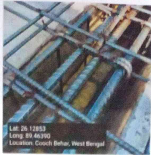
Roof Beam Bottom Support (16 mm dia, 2 nos.)