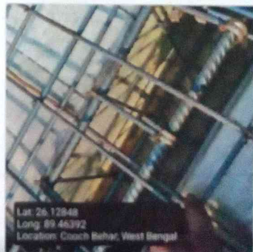
Roof Beam Mid Span Bottom Support (16 mm dia 4 nos)