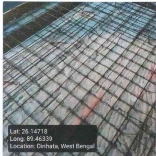
Roof Details Parameters Image