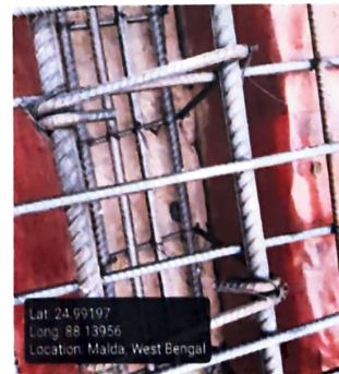
Roof Beam Mid Span Top Support Image