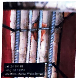
Roof Beam Mid Span Bottom Support Image