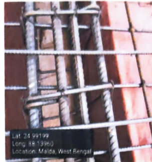
Roof Beam Top Support Image