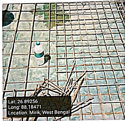
Binder for Roof Beam Support (250mm X 250mm)