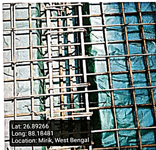
Roof Beam Mid Span Bottom Support (16 mm dia 4 nos)