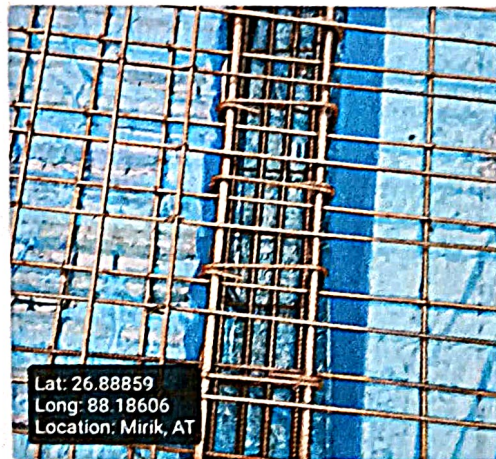
Roof Beam Mid Span Bottom Support (16 mm dia 4 nos)