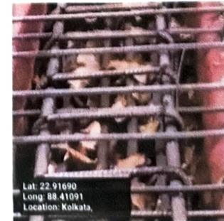
Roof Beam Mid Span Bottom Support Image