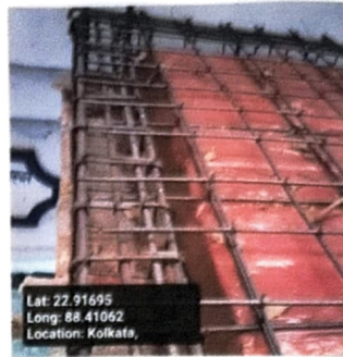
Roof Beam Top Support Image