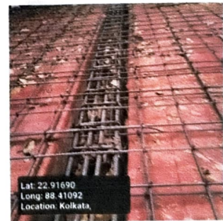
Roof Beam Mid Span Top Support Image