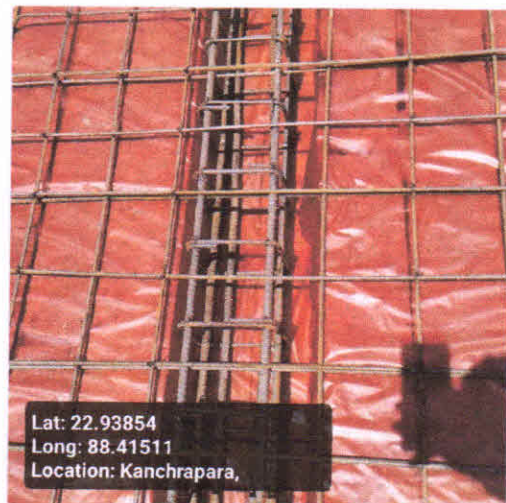
Roof Beam Mid Span Bottom Support (16 mm dia 4 nos)