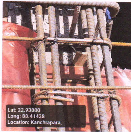
Roof Beam Mid Span Top Support (16 mm dia 2 nos)