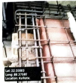
Roof Beam Top Support Image