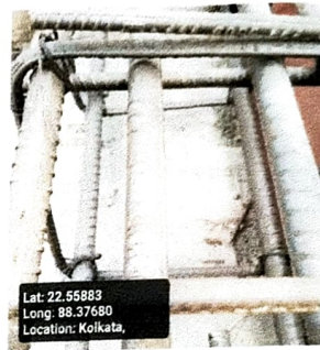
Roof Beam Bottom Support Image