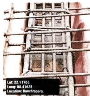
Roof Beam Mid Span Bottom Support Image