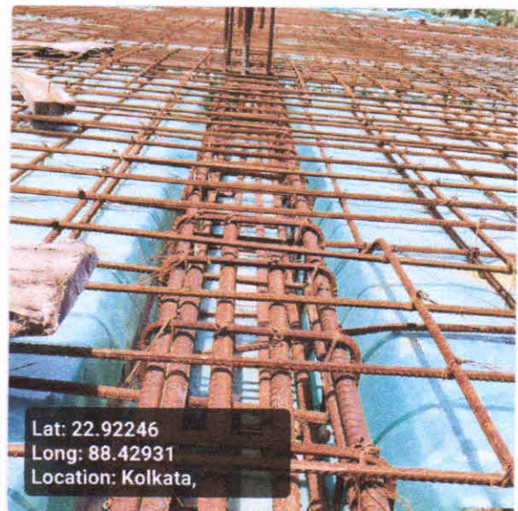
Roof Beam Mid Span Top Support Image