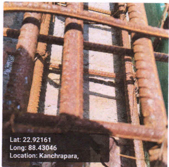
Roof Beam Mid Span Top Support (16 mm dia 2 nos)