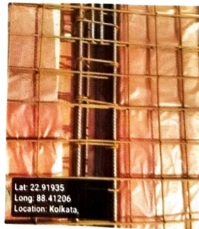
Roof Beam Mid Span Top Support Image