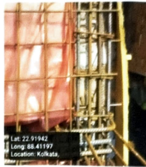
Roof Beam Top Support Image