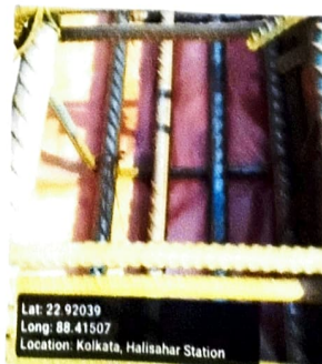
Roof Beam Mid Span Bottom Support Image