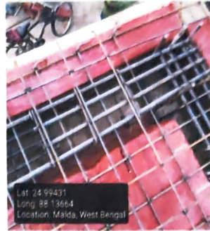
Roof Beam Top Support Image