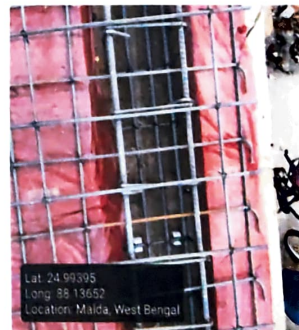
Roof Beam Mid Span Top Support Image