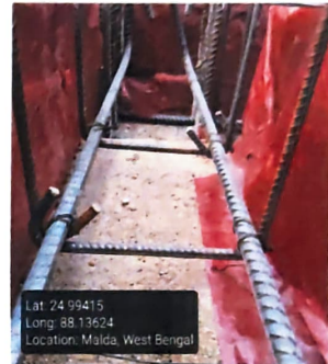
Roof Beam Bottom Support Image