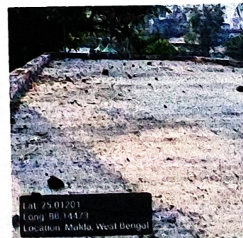
Roof Beam Mid Span Bottom Support Image

Lat: 25.01201 Long: 88.14471 Location: Malda, West Bengal